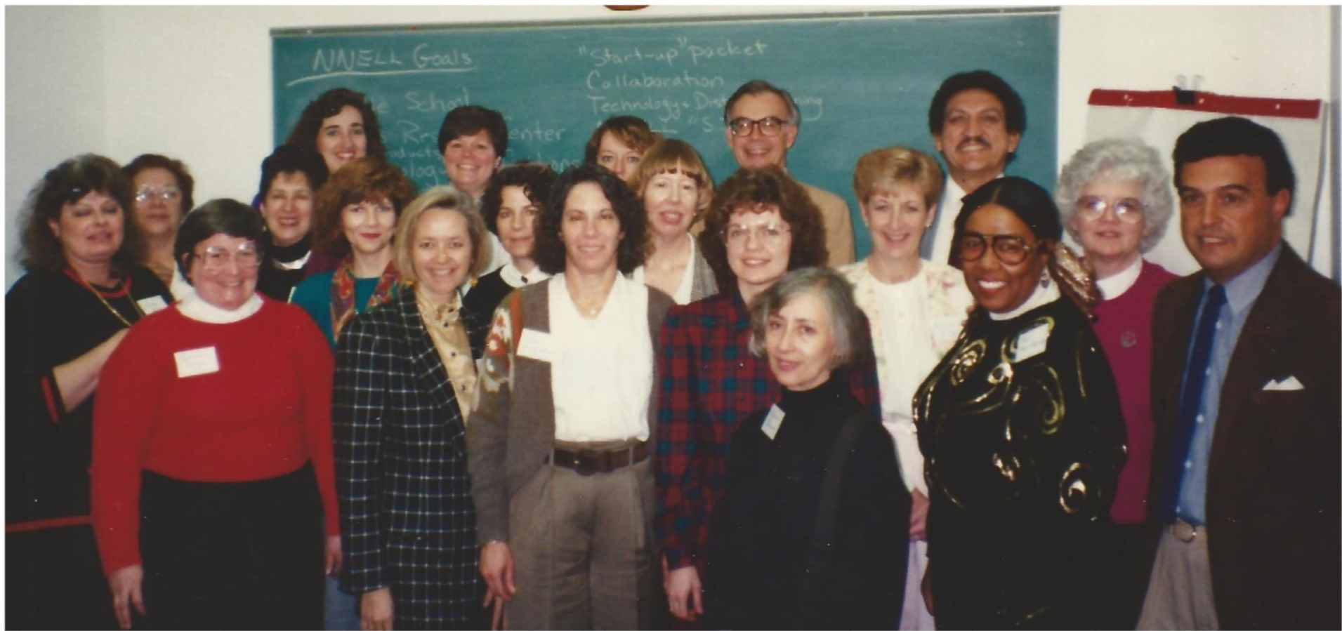
NNELL members meet in 1991 at CAL to decide NNELL's fate.