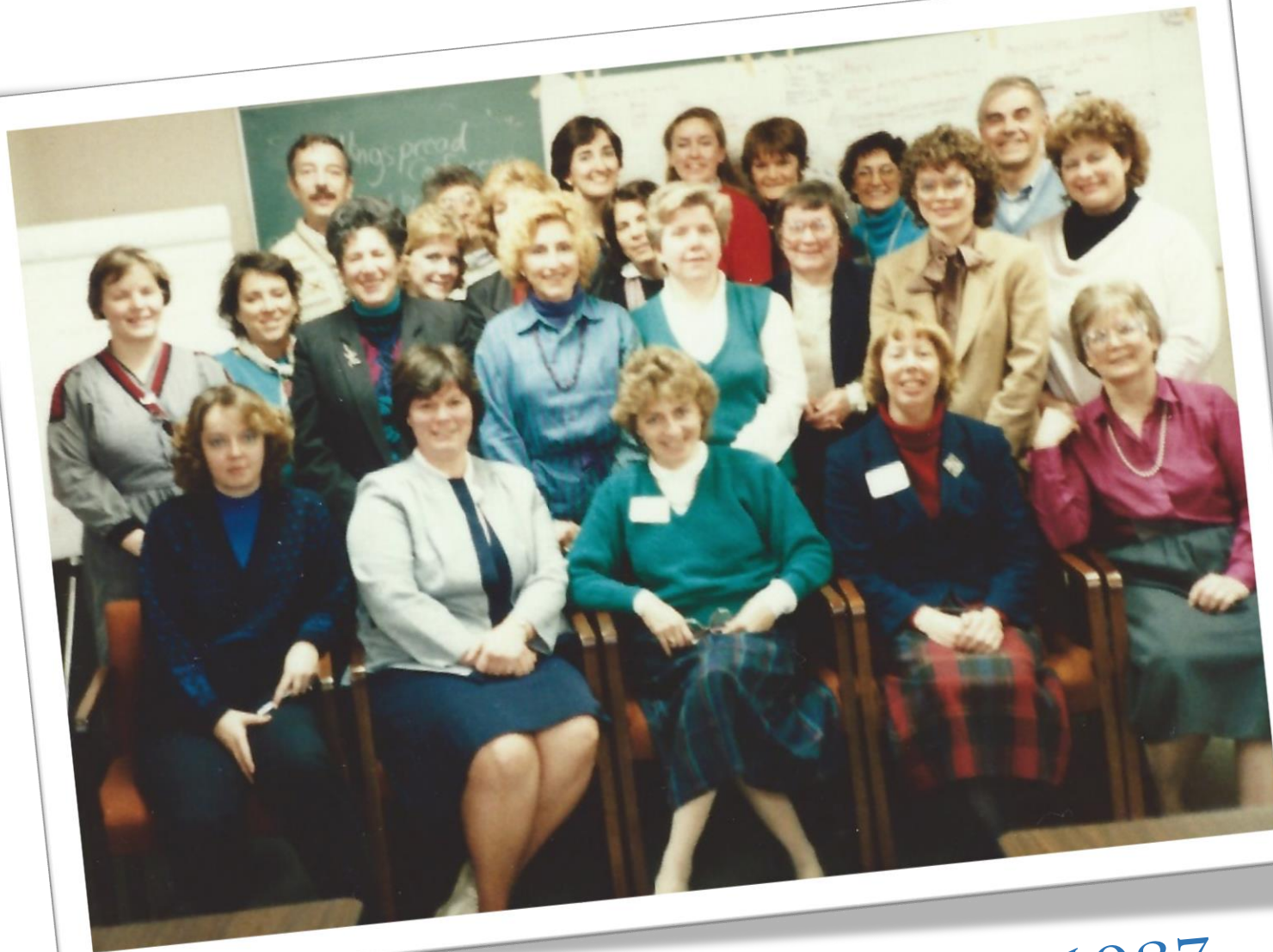
Founding Members of NNELL, 1987