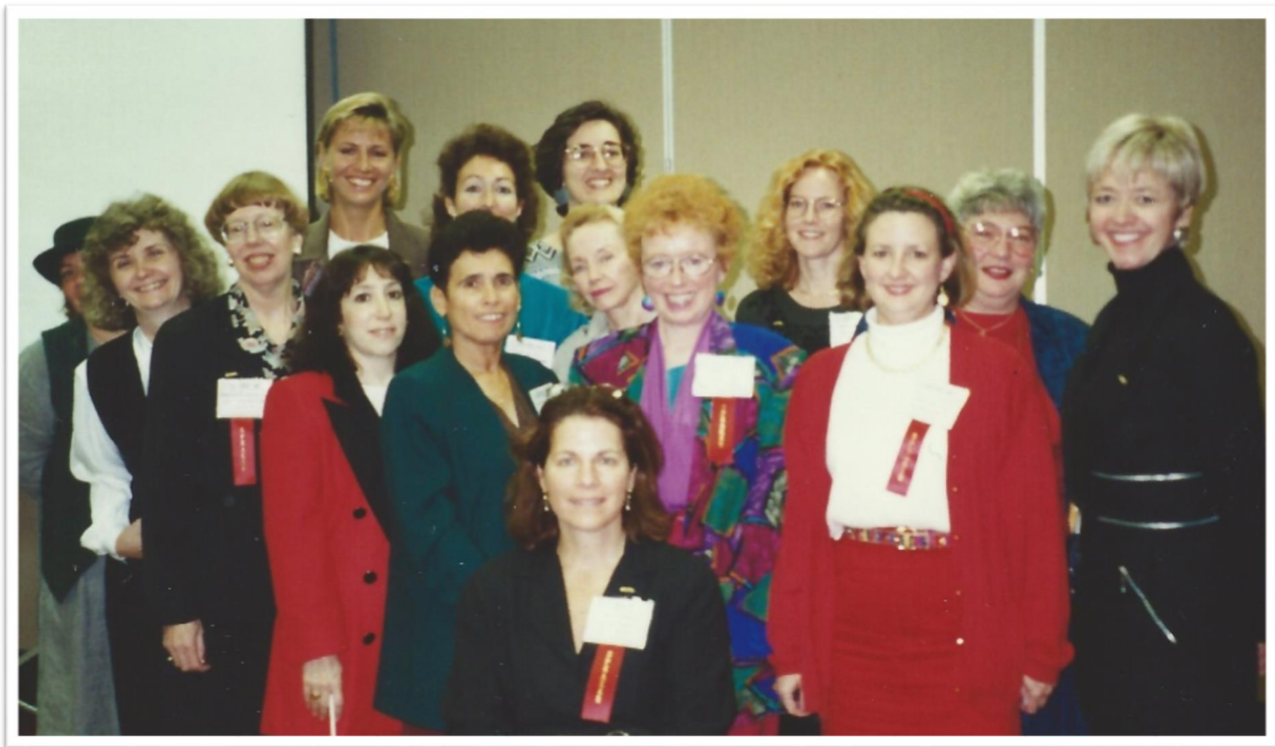
NNELL Board Meeting, ACTFL Atlanta, 1994