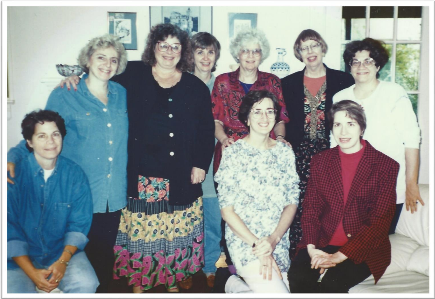
NNELL members meet in 1993 to draft proposal for first ever federally-funded National K-12 Foreign Language Resource Center (at Iowa State University).