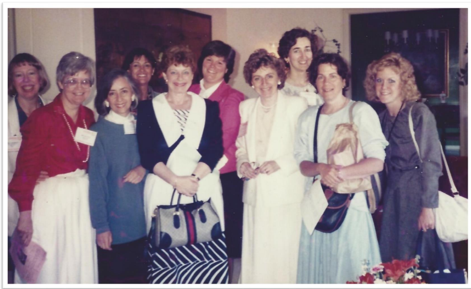
NNELL networking meeting at Northeast Conference in NYC, 1987, focuses on topics to include in first issue of FLESNEWS.